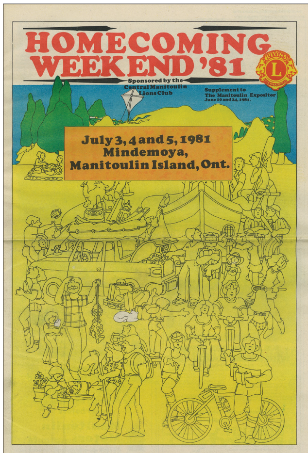
The cover of the 1981 Mindemoya Homecoming supplement.