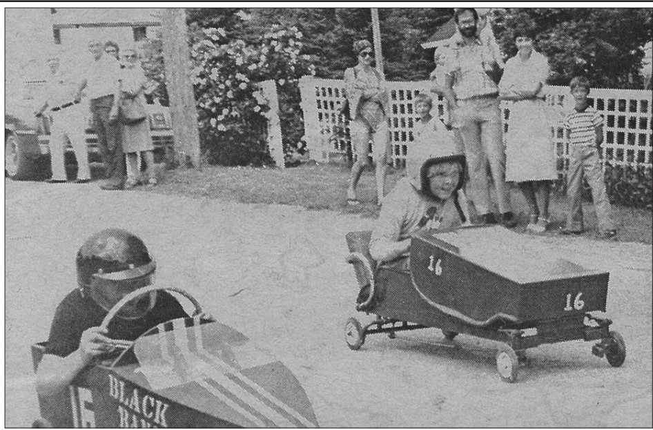
The Mindy Indy

A past favourite of Mindemoya Homecoming Weekend was the soap box derby, aptly named the 'Mindy Indy.'